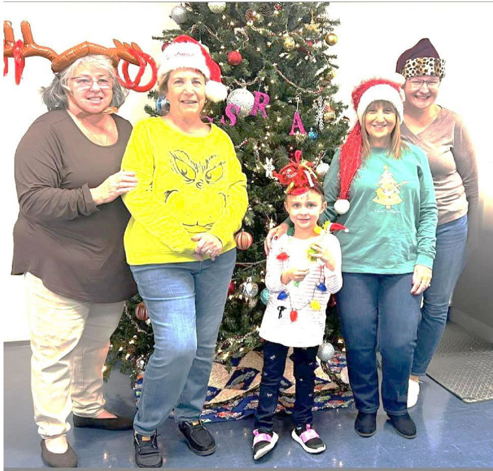
WHAT A CHRISTMAS DECORATING CREW