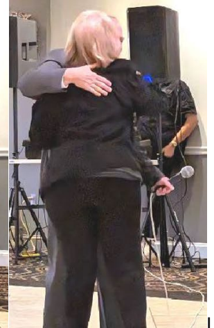
GUESS BEING THE ANNOUNCER YOU GET TO HUG AND KISS ALL THE AWARD GIRLS